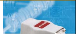
Test Lab Valve