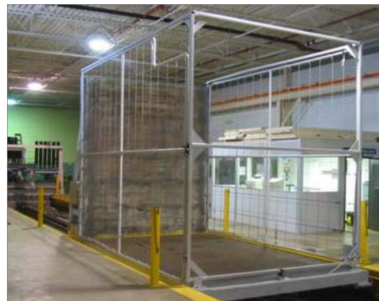
Real World Rail Impact Tester

Full scale simulation of rail car coupling ("humping")