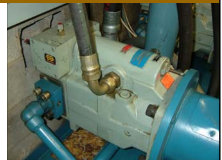
Test Lab Pump

32399 Milton, Madison Heights MI 48071 ♦ 248.585.7733 ♦ Fax 248.585.7979 ♦ www.st-lawrence.com